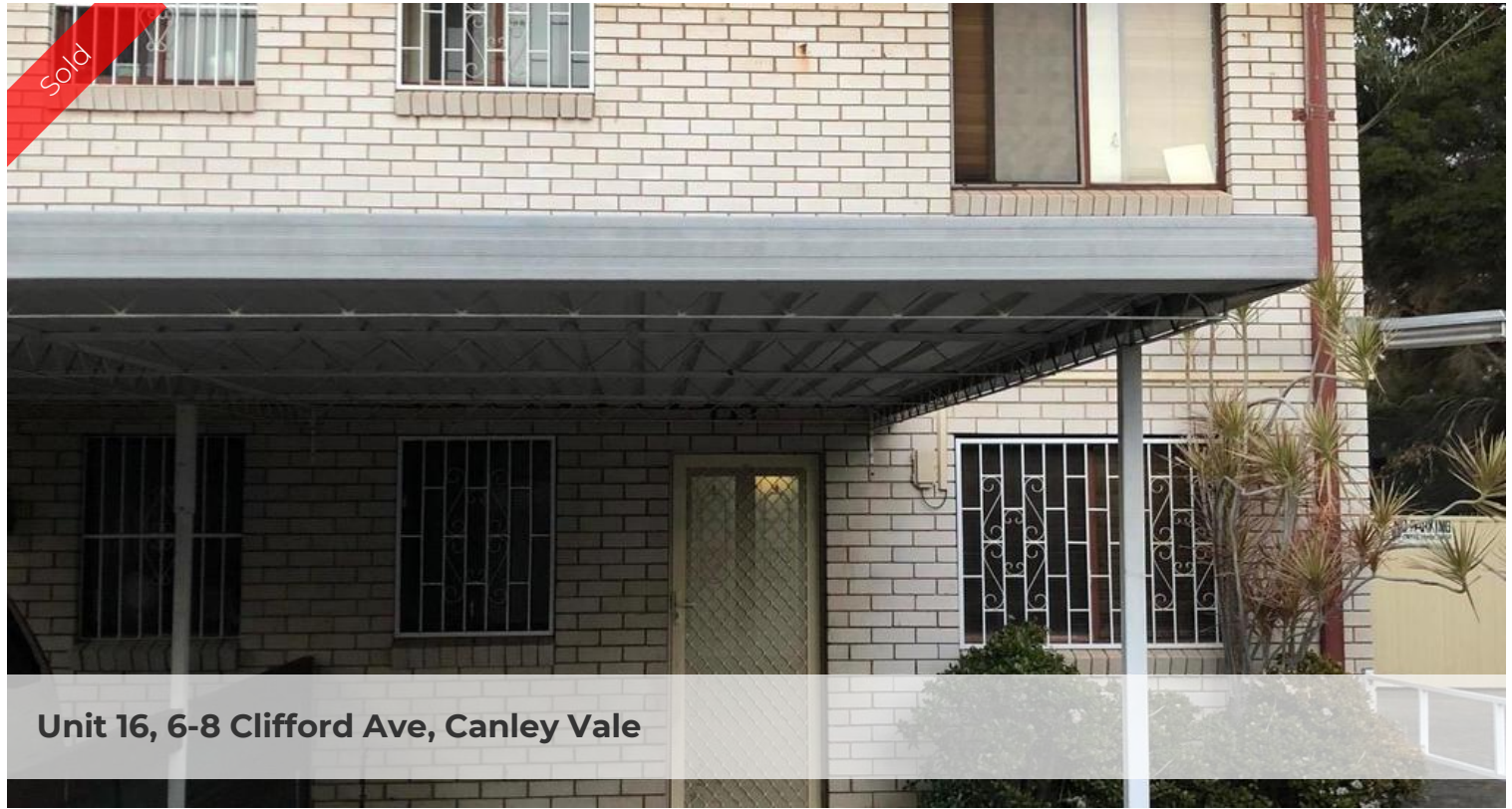
Unit 16, 6-8 Clifford Ave, Canley Vale